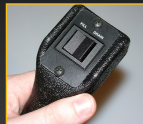
Fingertip controlled pendant with 11' reach allows one tech service.